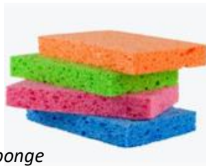
kitchen cellulose sponge